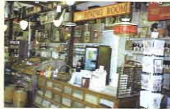
Old fashion country store gift shop.

The Millrace Restaurant is here to serve you a truly home-cooked breakfast and lunch. Our pancakes and cornbread mix are made right here in the mill. Fresh, whole grain breads are baked daily along with homemade pies and cookies that are the best around.