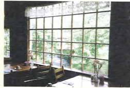
Your breathtaking view of Clifton Gorge.

Come take a tour and see how water power is still converted to energy to run the mill. You will see the early machinery and know-how of the early millers and the way stones grind grain into flour. It is truly an educational experience that you and your family or group will long remember. Come and see or call us for details.