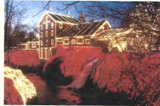
2.5 million lights enhance the mill and gorge.