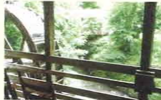
The deckview of the river and gorge.

Where else can you enjoy the best of home style cooking while savoring the atmosphere of yesteryear? Sit back and relax to the gentle sounds of the old mill wheel and soft rhythm of the water cascading over the falls. Experience all this while sitting and looking out at our covered bridge and one of the country's most beautiful natural views, the Clifton Gorge.